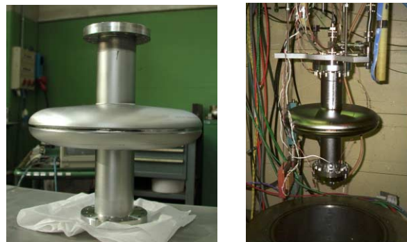
Figure 1. Prototype Z102 after welding in Zanon and Z101 during tests at Saclay

Of these cavities, the first one has already been tested in a vertical cryostat and its performances are discussed in the following paragraphs. Figure 1 shows the first two TRASCO cavity prototypes.